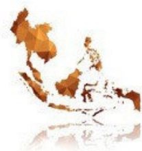
IPKey | SOUTH-EAST ASIA