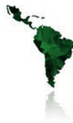
IPKey | LATIN AMERICA