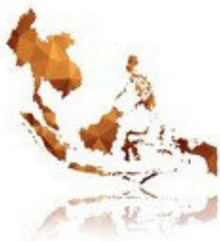
IPKey | SOUTH-EAST ASIA

Challenges in plant variety protection and opportunities for cooperation