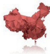
IPKey | CHINA