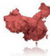
IPKey | CHINA