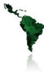
IPKey | LATIN AMERICA