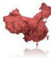
IPKey | CHINA