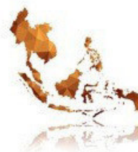
IPKey | SOUTH-EAST ASIA