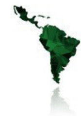
IPKey | LATIN AMERICA