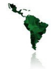
IPKey | LATIN AMERICA