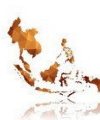
IPKey | SOUTH-EAST ASIA

IP Key LA designed a two-day activity to encourage an exchange of best practices on protecting and promoting successful GIs, which included an open seminar led by EU experts and a closed workshop between representatives from Colombia, Ecuador, Peru and the EUIPO.