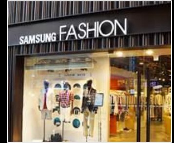
C&T Fashion Group