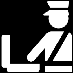
U.S. Customs & Border Protection