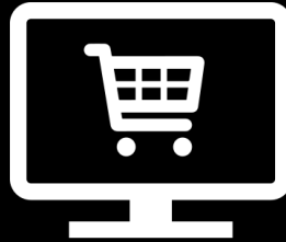
Online Market Places